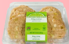
Key Lime Item # 49006 UPC 014821490063