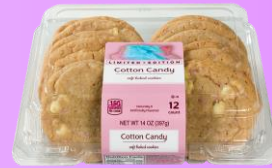
Cotton Candy Item # 49005 UPC 014821490056