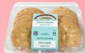
Pina Colada Item # 49007 UPC 014821490070