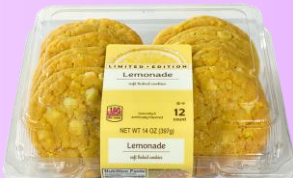
Lemonade Item # 49016 UPC 014821490162

Forecast Due January 1, 2024 First Ship Date February 12, 2024 Last Order Date May 20, 2024