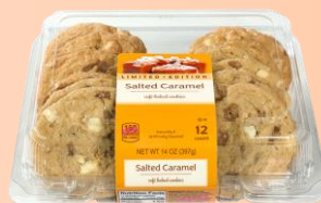
Salted Caramel Item # 49011 UPC 014821490117