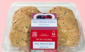
Red, White & Blue Item # 49015 UPC 014821490155

Forecast Due April 8, 2024 First Ship Date May 20, 2024 Last Order Date August 19, 2024