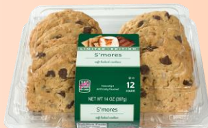
S'mores Item # 49010 UPC 014821490100