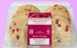
White Chocolate Raspberry Item # 49014 UPC 014821490148