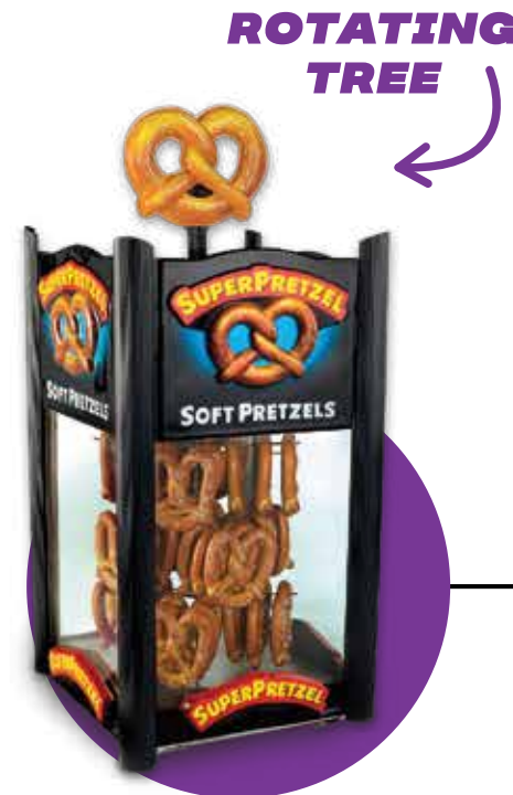
MODEL 2000 WARMER DISPLAY