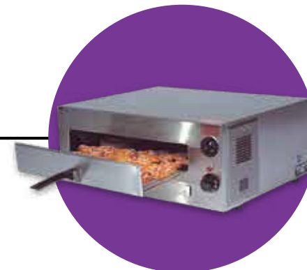
MODEL 561 BAKING OVEN