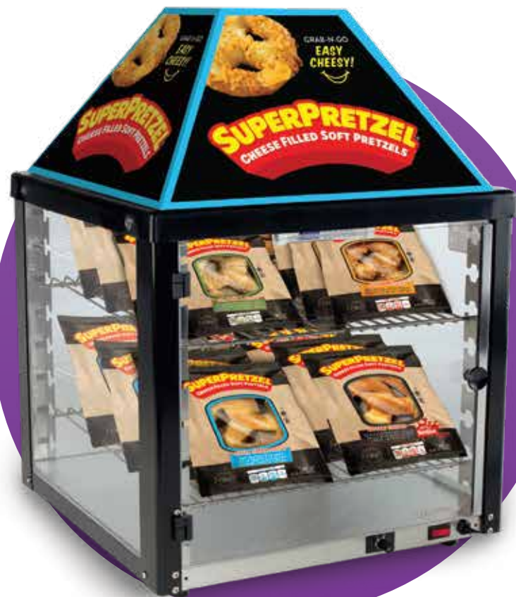
MODEL 312 STERNO DISPLAY

We offer an extensive variety of equipment & Branded accessories to support our products! This includes: Display Warmers, Baking Ovens, Branded Warmer Cling Kits, and more!