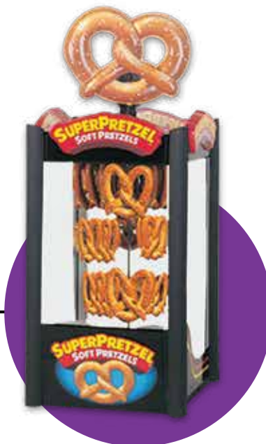
MODEL 850 WARMER DISPLAY