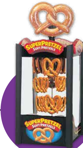
MODEL 850 WARMER DISPLAY