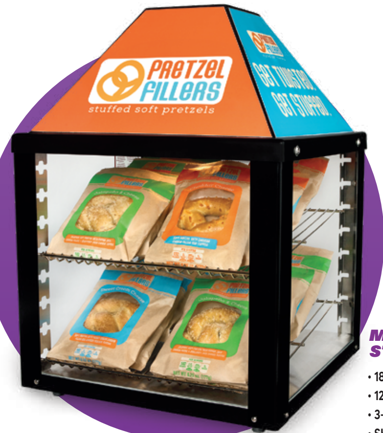
MODEL 312 STERNO DISPLAY

We offer an extensive variety of equipment & Branded accessories to support our products! This includes: Display Warmers, Baking Ovens, Branded Warmer Cling Kits, and more!