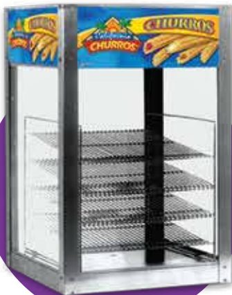
MODEL 925 WARMER DISPLAY