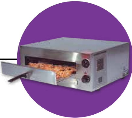
MODEL 561 BAKING OVEN