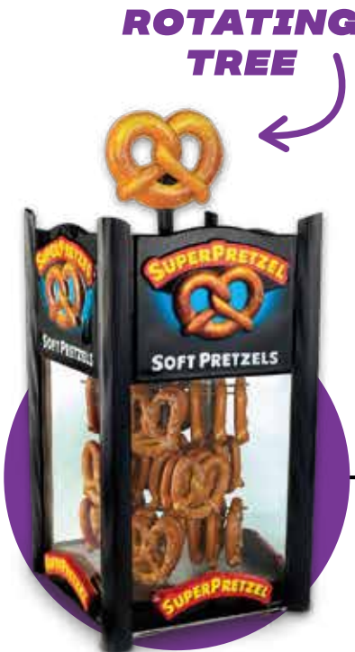
MODEL 2000 WARMER DISPLAY