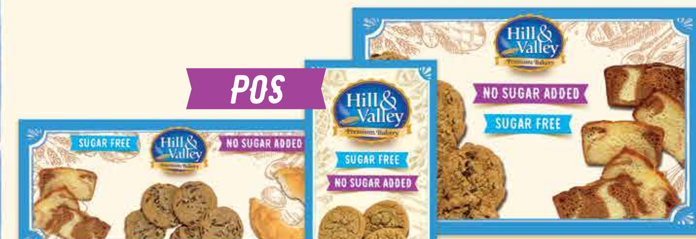
Header Cards - Racks (12" x 19.75")