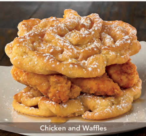
Chicken and Waffles

visit www.jjsnackfoodservice.com for more information on these and other great recipe inspirations!