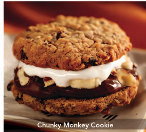
Chunky Monkey Cookie