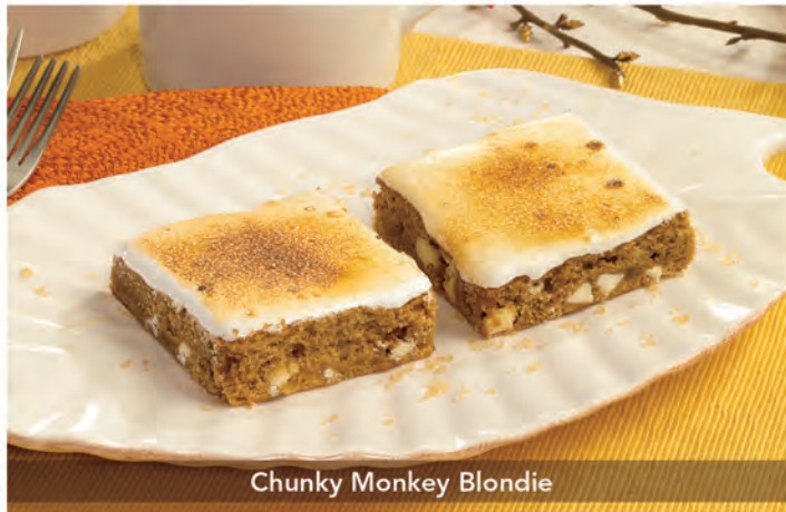
Chunky Monkey Blondie