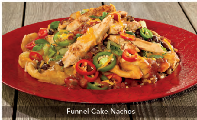
Funnel Cake Nachos