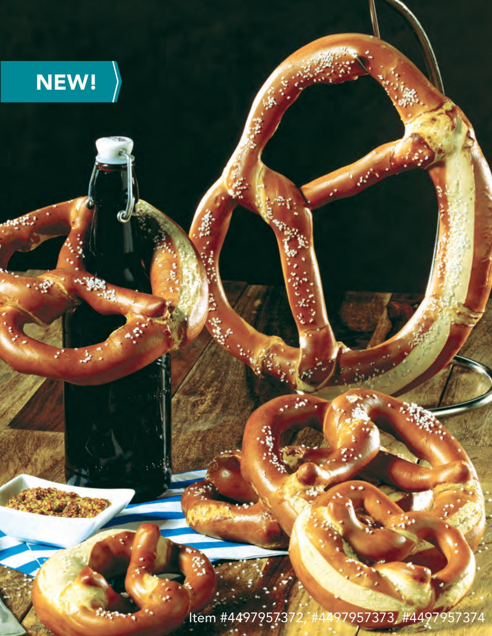
Item #4497957372, #4497957373, #4497957374