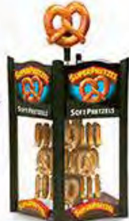
MODEL 2000 WARMER DISPLAY