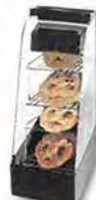
MODEL 304-7 DISPLAY