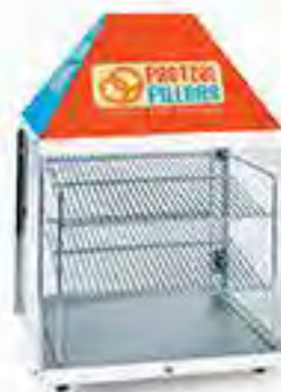
MODEL 312 STERNO DISPLAY