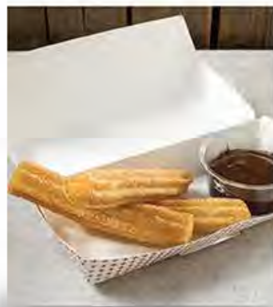
Item # 3314

TIO PEPE'S® Churros are authentically crafted for any occasion. Served with a slightly crispy exterior and warm moist center, the sweet taste of TIO PEPE'S® Churros are enjoyed by children and adults alike! Also available in filled varieties.