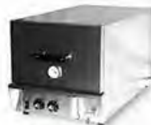
MODEL 3506W HEATED DRAWER WARMER