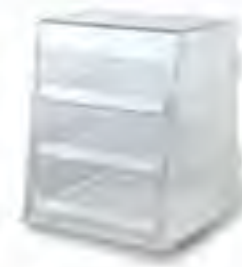
MODEL 246-3 PLEXI GLASS DISPLAY