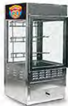
MODEL 702 STERNO DISPLAY