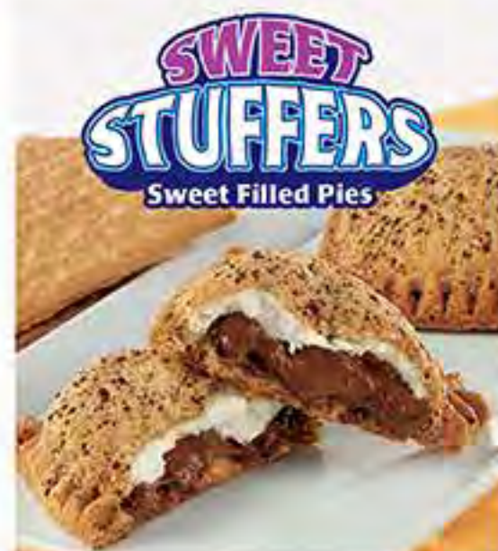
Item # 88289970