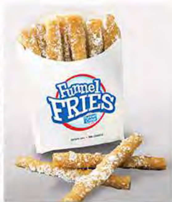
Item # 4530

FUNNEL CAKE FACTORY® Funnel Fries are a twist on the traditional french fry! Bringing together the fresh, sweet taste of funnel cakes with grab-n-go versatility, THE FUNNEL CAKE FACTORY® Funnel Fries are a great way to bring the carnival to you!