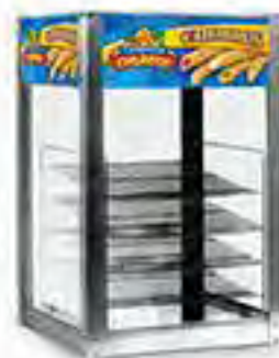
MODEL 925 WARMER DISPLAY