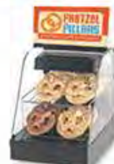
MODEL 304 DISPLAY