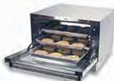
MODEL 860D BAKING OVEN