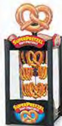
MODEL 850 WARMER DISPLAY