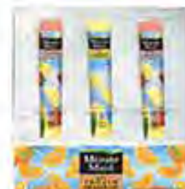
MODEL 496 COUNTER TOP MERCHANDISER