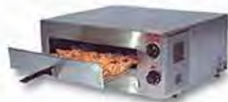
MODEL JJ 561 DIGITAL OVEN